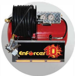
ENFORCER 10 CAFS