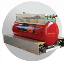
ENFORCER 60 CAFS