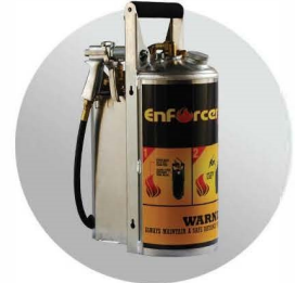
ENFORCER 3 SUPER DUTY